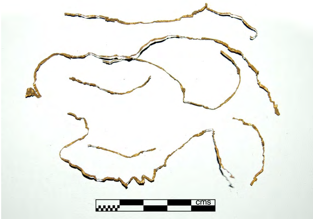
Fig.21: Flat gold strip, 0.8-1.2 mm wide, ON 1966 from Western cemetery grave C3741.

The third tablet weave runs across the back of buckle ON 1165 from Central cemetery grave C1261 (Phase 4b-5). This has been woven on two-hole tablets and the tablets have been rotated in two decks, one alternating with the other: both these features give a thinner band than is usual with four-hole tablets or tablets rotated as a single deck. Other examples of this technique have been recorded in Migration Period graves, at West Heslerton, North Yorkshire, grave 62 (Walton Rogers 1999, 150-1), at Morning Thorpe, Norfolk, grave 334B (E Crowfoot 1987b, 181) and at Wakerley, Northants, grave 78 (E Crowfoot 1989, 171), and there was another in a 7th-century burial at Dover Buckland (1994), grave 376, Phase 6 (Walton Rogers forthcoming).